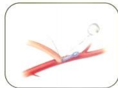
Easy Atraumatic Removal