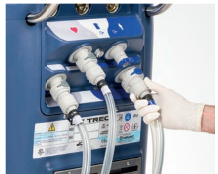
Self-sealing quick connect fittings prevent leaks