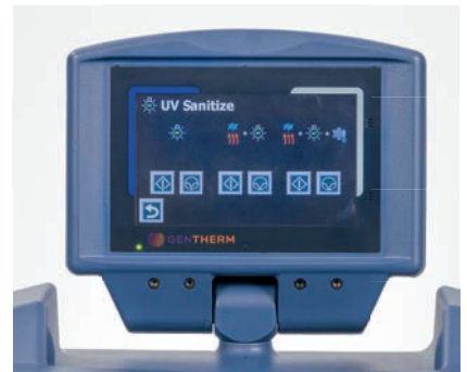
User activated UV sanitization – start and walk away