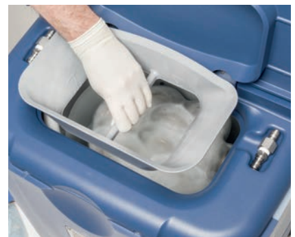
Fast, efficient ice block generation